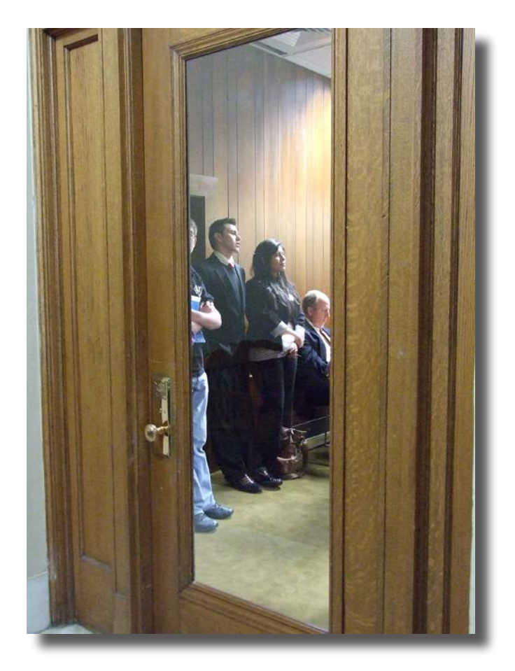
At the Youth Lobby Day, young people sat in on committee hearings to hear legislators debate bills that were initiated by the Citizens First Congress.

Arkansas taxes low-income people at twice the rate that we tax our wealthiest people. We have one of the most regressive tax policies in the country and nearly every time the legislature meets they make the system worse. We support low- and middle-income tax relief and oppose tax cuts for big businesses and the wealthy. To keep the state budget balanced, we also oppose tax cuts made without corresponding spending cuts or tax increases.