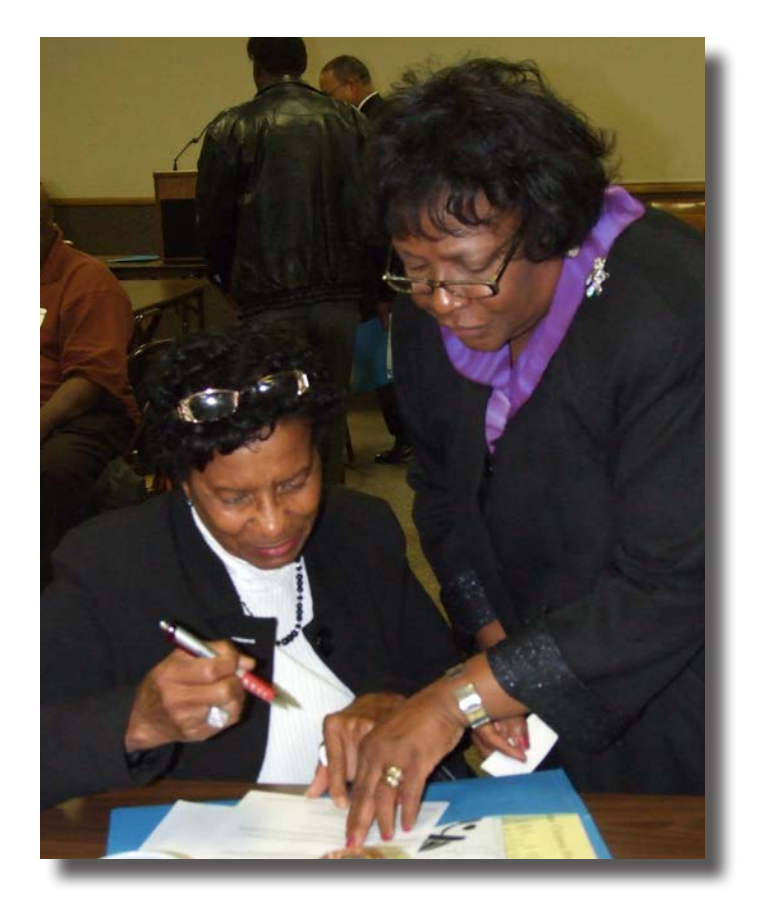
CFC members review talking points before going to the Capitol to talk to their Senators.

During the legislative session, the CFC Steering Committee votes to support, oppose or track various bills based on the CFC's platform. We advocate for those positions, send alerts to the public and monitor how legislators vote.