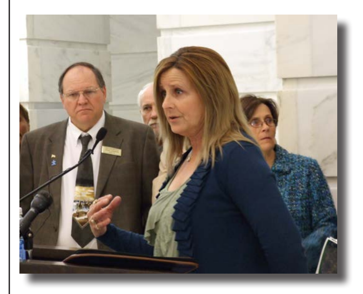
Landowners pressed legislators to pass reasonable regulation of the natural gas drilling industry to protect land and water from the effects of "fracking."

This package of legislation to better regulate the natural gas industry was based on model policies that are already working in other states, but it faced overwhelming industry opposition. The legislature committed to hold interim hearings to further examine the need for better protections from the dangers of natural gas drilling. Interim hearings are a positive step forward, and will give landowners who are concerned about pollution from gas drilling the chance to testify. We will continue talking with landowners, lawmakers, state agencies and the gas industry about more responsible ways to develop natural gas.