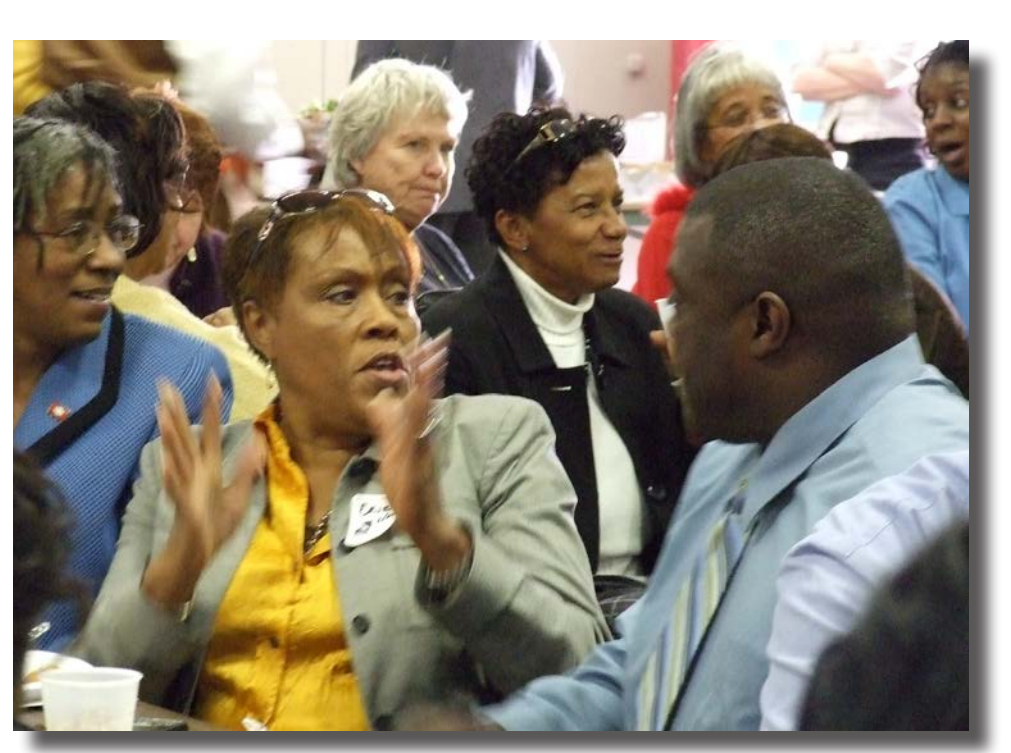
The Citizens First Congress held five lobby days. Hundreds of people came to the Capitol to make a difference.

HB1881 – Leding – Failed in the House To require all employers to pay discharged employees by the next regular payday, prohibit unauthorized deductions from pay and establish a civil penalty for non-payment of wages.