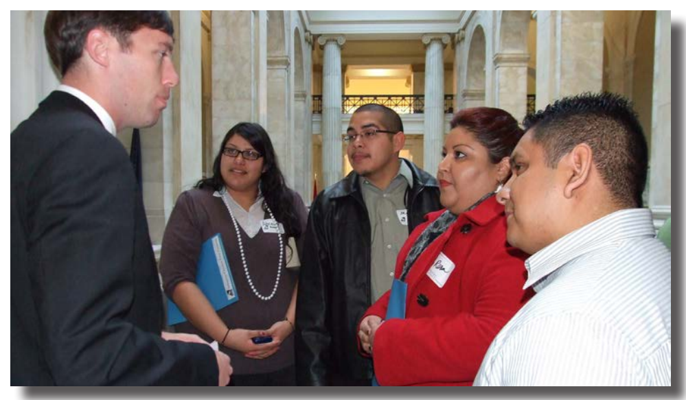
Latino youth talking with their legislator about the DREAM Act.