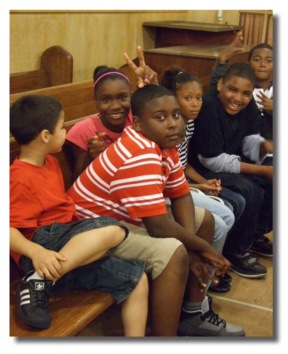
Over 40 youth from south Arkansas gave up some of their spring break to come to Little Rock the night before the CFC's Youth Lobby Day to learn about how the political process works in Arkansas.

And we thank the lawmakers for putting in the time and hard work required to serve Arkansas.