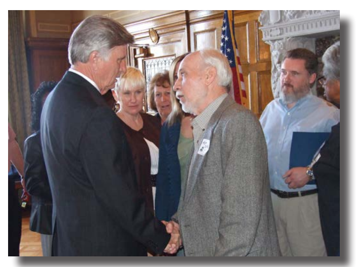
Arkansas landowners ask Governor Beebe to support reasonable regulation of natural gas drilling, also known as "fracking."

Other significant legislation was considered which is not included in this guide. You can find more on www.CitizensFirst.org or www.arkleg.state.ar.us — the Arkansas Legislature's web site.