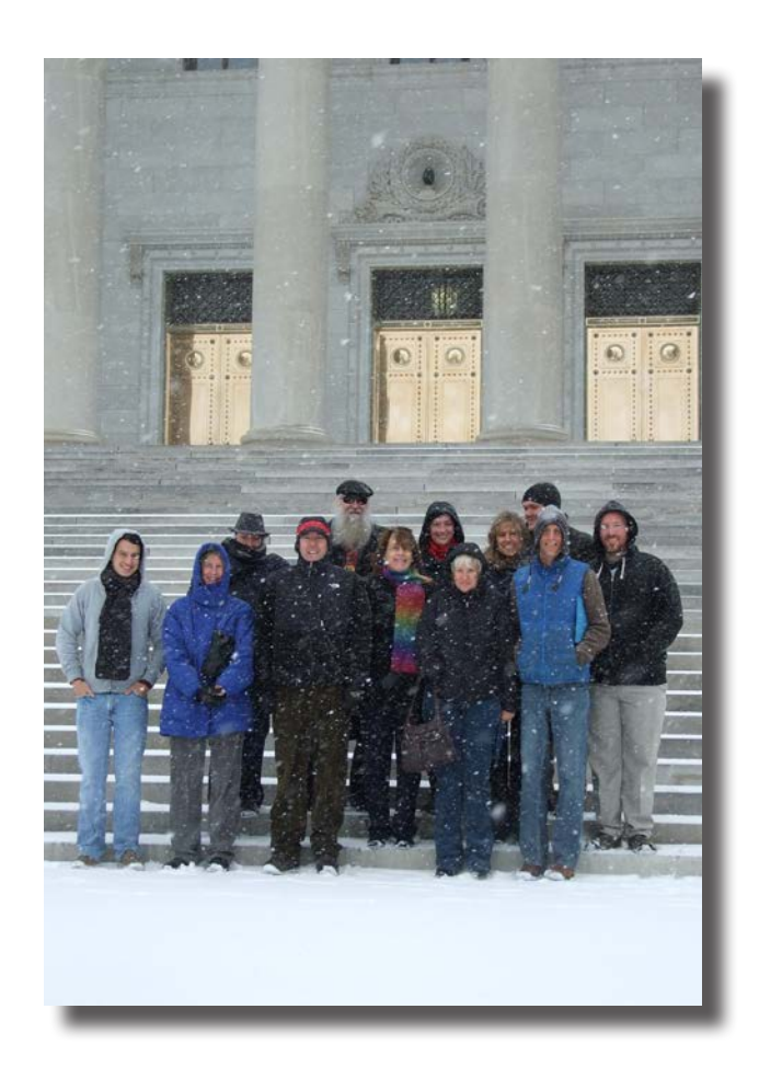
On the snowiest day, citizens were at the Capitol to support legislators who championed water protections and renewable energy.

This passed unanimously—we have not recorded the vote in this guide to make space for more varied votes.