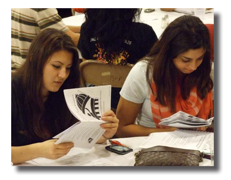
Students from northwest Arkansas study the legislative committees at the CFC's political process training workshop.

To implement health insurance exchanges at the state level.