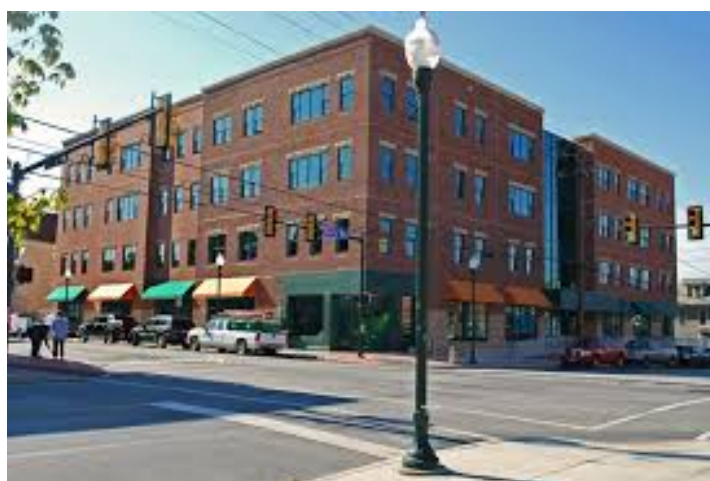
Midtown's Campus Square Building – Home of Commonwealth Connections Academy

The K-through-12 educational program described above will be taught in an innovative partitioned one-room schoolhouse format. Grades K to 2 will be taught in a classroom that contains divided educational pods for different educational levels and subjects, and grades 3 to 5, 6 to 8, and 9 to 12 will have their own flexible, innovative classrooms. In this format, students will be able to progress through subjects and educational levels more fluidly and appropriately than in a more traditional, graded-classroom setting.