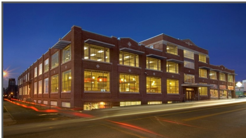
HACC Midtown II

A significant advantage of HACC's role in Education Row will be that it will allow CCA students to begin their college academic courses or trade certification study while they are still in high school. HACC's presence will also help in allowing CCA students to explore careers early in their high school years.