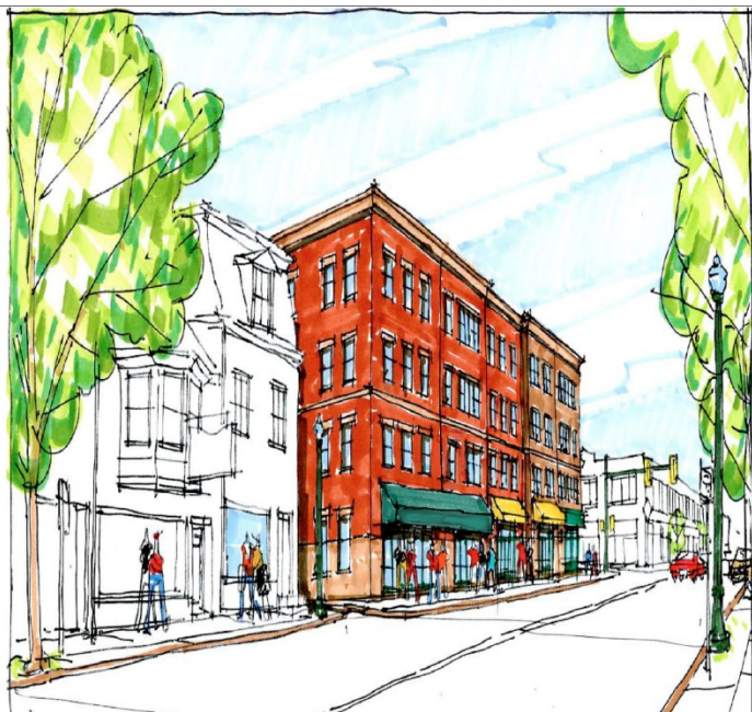
Education Row in Midtown Harrisburg

The vision has been intentionally built for scalability and replicability, as the problem being addressed is a national issue, and not an issue unique to Harrisburg.