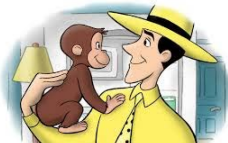
Curious George – Early Childhood STEM Education

offer access to its wide portfolio of PBS educational programs, to offer workshops and training to credential the early childhood educators at U-GRO and CCA, and to offer supplemental workshops to help train teachers in the use of PBS-based educational materials. This PBS content will be used as a supplement to the standards-based curriculum, and will serve to bring familiarity, energy, and additional insight to the curriculum. The wide spectrum of PBS educational programs that WITF will bring to the initiative are geared for students from pre-K through high school, and each program is supported by educational games, video clips, and teaching aids to assist teachers in using the content. PBS content is already the most widely-used educational support material nationally, but the systematic use of these materials in a comprehensive educational program is unique.