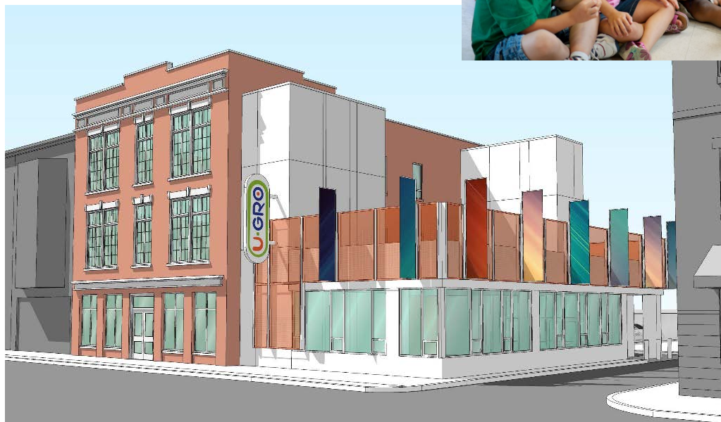
U-GRO's New Education Row Facility

U-GRO's new facility in Midtown will be comprised of a 9,000-square-foot building with an adjoining newly-built indoor play space and