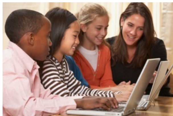
Computer-Based Learning at Commonwealth Connections Academy