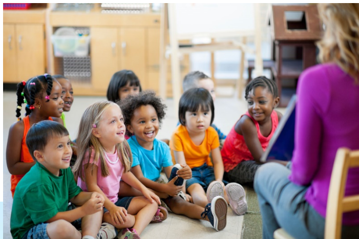
Story Time at U-GRO – Curriculum-Based Pre-K

U-GRO Learning Centres will move into a new location in Midtown Harrisburg to provide a standards-based-curriculum pre-kindergarten program for children from ages one through five years. Begun in 1973, U-GRO serves more than 1,400 children in Central Pennsylvania, and is recognized as a Central Pennsylvania leader in pre-K education.