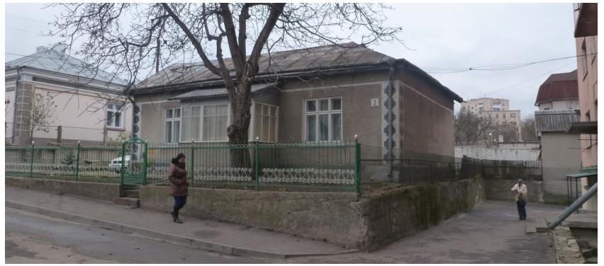
Figure 8 this is a view on a house from the street. The house is in the corner of that property, which gives an opportunity to use the land more efficiently.