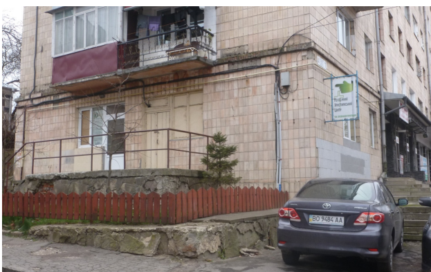
Figure 2 This is the place we rent now.