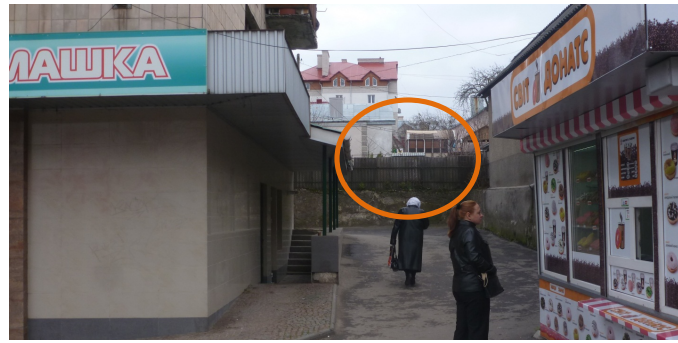
Figure 5 Our place is on the left from this multistory building. The land that we want to buy is marked on this picture. The house is behind this building. In the future we can make an entrance right after this crosswalk.