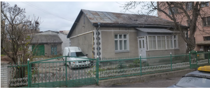
Figure 9 The garage and storage is on the back next to our neighbors.