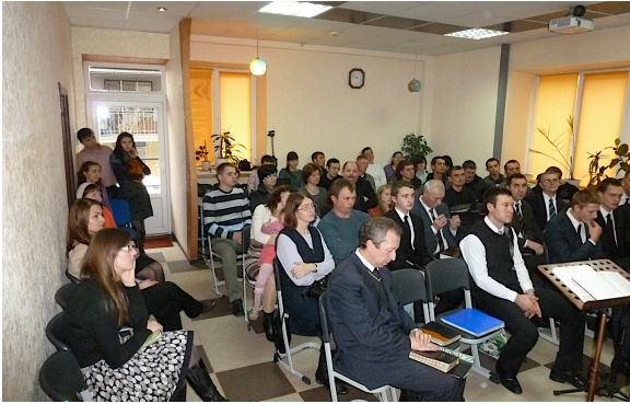
Figure 4 When guests come there is not much room, and it is stuffy. We can't have there our final meetings of our camp because it fits only 50-55 seats.