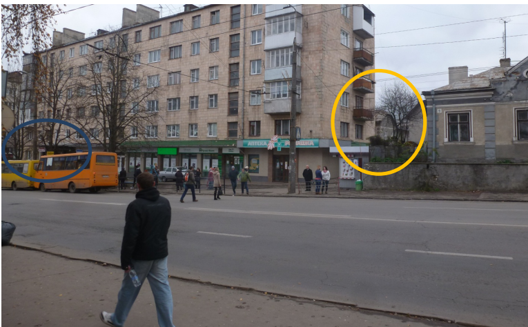
Figure 7 From this corner you can see the house (yellow mark). The office that we rent now is on the left (blue mark). On the other side of the road you can see a bus stop that leads to the center of the city. This picture was taken from another stop.