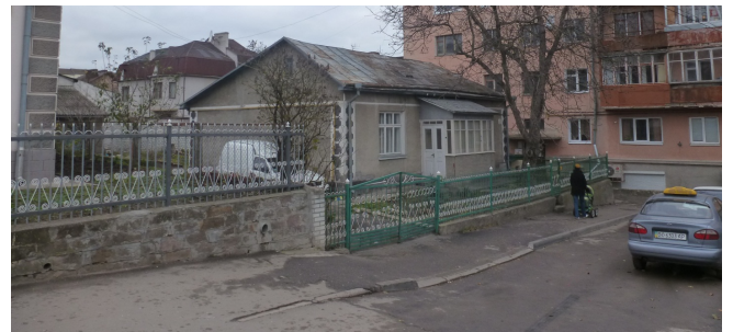
Figure 10 There is a road next to the house.