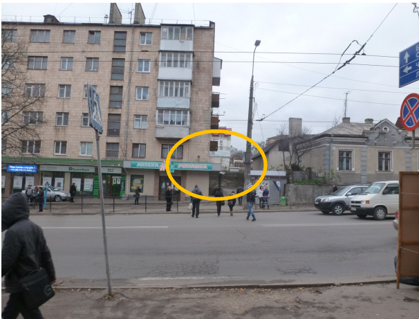
Figure 6 The land is next to the crosswalk where many people are walking everyday.