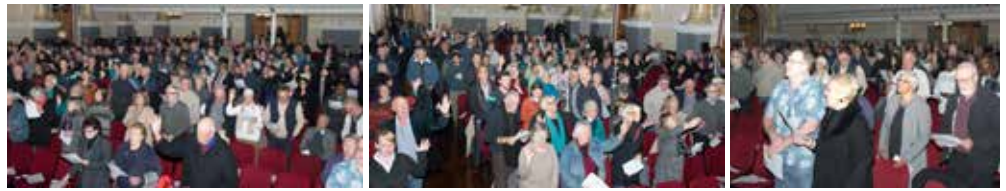
Many denominations and cultures worshipping as one in the Adelaide Town Hall

Here are some amazing scenes of a Town Hall event which took place approximately two weeks before the election ( pictured right ). With no budget, five weeks to put together and a coalition of cross-denominational and cross-cultural leaders (some of whom have never worked together), the Lord orchestrated a night of unity, intercession and political action that stirred the heavenlies. Unbeknown to us, it turned out to be exactly the 150th anniversary of the Town Hall opening. The Adelaide Declaration was proclaimed and 100,000 How to Vote Below the Line pamphlets were distributed.