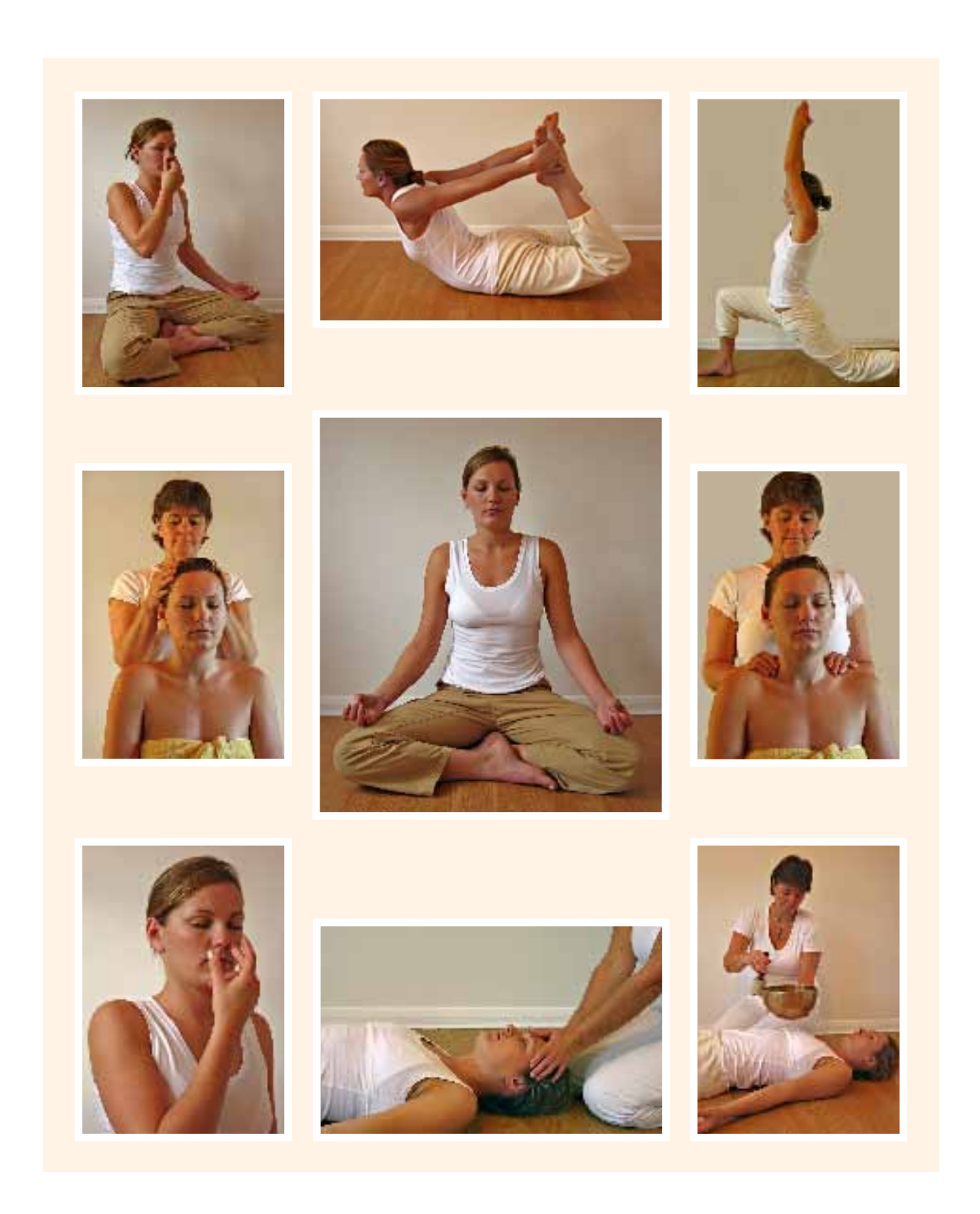
In a quiet, calm & peaceful environment