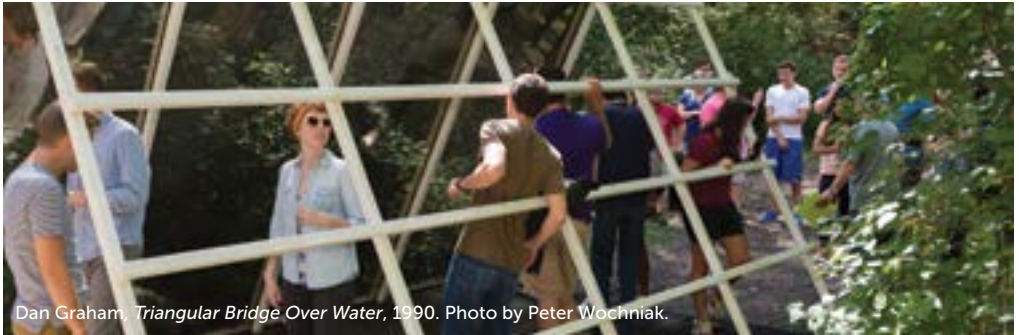
Dan Graham, Triangular Bridge Over Water, 1990.

Now in its second year, Laumeier's Teen Program is designed to encourage creative expression in young adults, offering workshops and mentoring to assist teens in preparing well-rounded portfolios. The Teen Program meets the second and fourth Wednesdays of each month during the school year and includes artist visits, studio workshops and portfolio review sessions. Critiques and active discussions about contemporary art, concepts and the local arts scene strengthen students' knowledge and encourage engagement with area arts organizations.