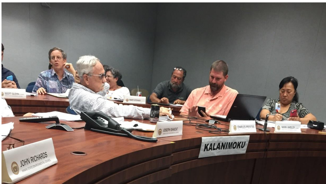
The dedicated and cheerful volunteer members of Environmental Council met in quorum assembled on May 21, 2015 in the Kalanimoku Video Conference Center on Punchbowl Street.