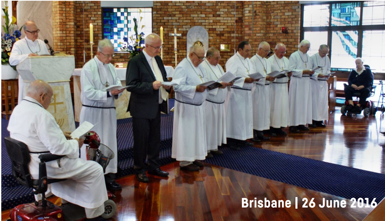
Brisbane | 26 June 2016