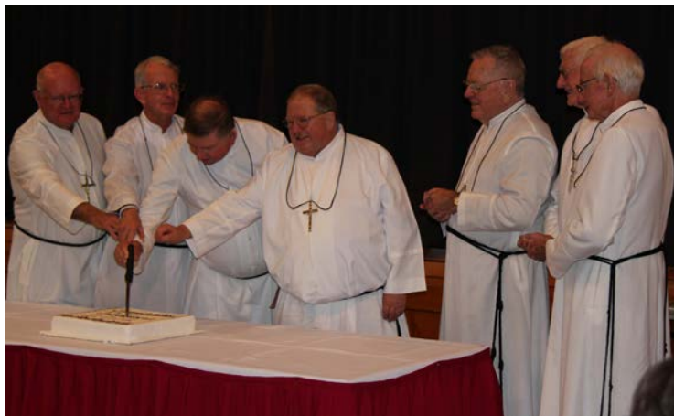
Sydney | 2 July 2016