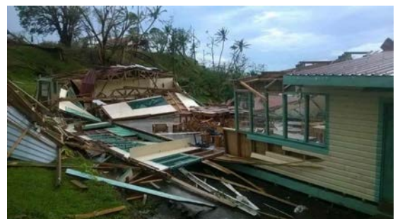
Cyclone Winston hit Fiji on 20 February and caused serious damage to Saint Vincent's College in Natovi, on Viti Levu, and major disruption to classes.