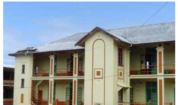
The entire roof of the Saint Columba building at the Marist Brothers Primary School in Suva needs to be replaced.