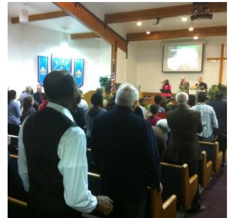
A time of worship