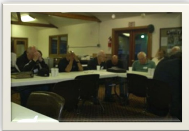
The Men Participating in a Time of Prayer