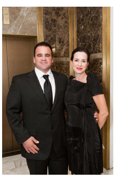
Thank you to all who attended and supported BIA's 20th Anniversary Gala & Benefit in November 2013.

It was a very special and successful evening and wonderful to see so many old and new friends!