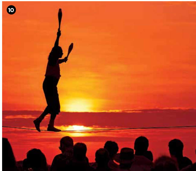
From above: A performer in Mallory Square, in Key West; colorful blooms at San Francisco's Conservatory of Flowers; outdoor dining at Napa's Bale Grist Mill State Historic Park.

Epicures and oenophiles from all over the world come here for wine-country excursions. One of the most spellbinding may be to Castello di Amorosa (4045 Hwy. 29, Calistoga; 707-967-6272), a Tuscan-style castle where visitors can wander clandestine passageways and taste handcrafted Italian-style wines. Get a different view of the valley by cruising the Napa River with Napa Valley Adventure Tours (1147 First St.; 707-224-9080; napavalleyadventuretours.com ) along restored wetlands and beside Napa's historic downtown. And for a peek into California's rural heritage, plan on an afternoon at Bale Grist Mill State Historic Park (3369 Hwy. 29, St. Helena; 707-942-2236), where you can leave with a bag of polenta, spelt or rye ground with millstones on-site. 5