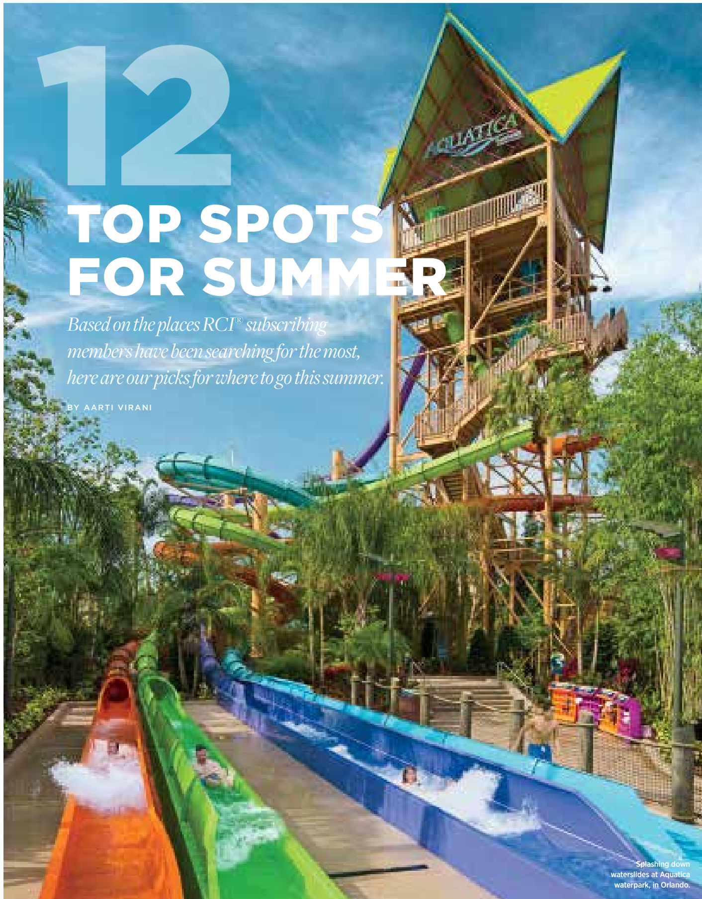
Splashing down waterslides at Aquatica waterpark, in Orlando.