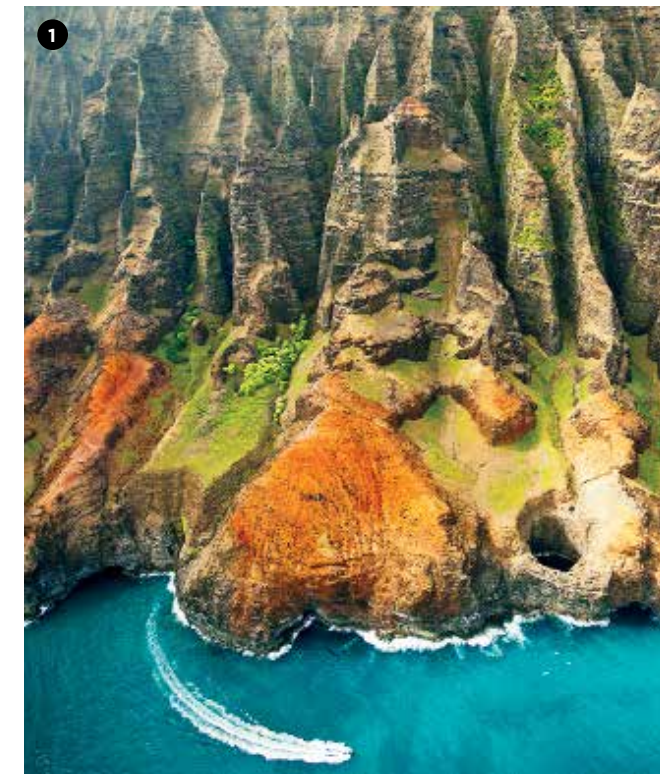
From above: Along the Nā Pali Coast, on Kauai; St. Stanislaus church, set in Altos de Chavón, a replica of a 16th-century village, in Punta Cana; sculptures on view in the visitors center at MUSA, an underwater museum in Cancún.

While party-hungry college students still dominate pockets of this coastal hot spot, you'll find a different side of town at Mercado 23 (SM 23, west of Avda. Tulum), one of Cancún's main markets, which stocks everything from Maya huipils (woven blouses) to mounds of Oaxacan cheese. Get your art fix at the MUSA (Blvd. Kukulcan km 15.2; 011-52-998-848-8327; musacancun.org), a mostly underwater collection of some 500 sculptures viewable by glass-bottomed boat or on dry land in the visitors center. A 25-minute ferry ride with Ultramar (José López Portillo, Puerto Juárez; 011-52-998-881-5890; granpuerto.com.mx/en), departing from the Gran Puerto Cancún Ferry Terminal, will land you on Isla Mujeres , which has some of the area's best snorkeling. You can explore the island's southern coast by golf cart and stop at Garrafon Natural Reef Park (Camino Sac Bajo, Lote 26, Paraíso Laguna Mar; 866-393-5158; garrafon.com), where trails lead to the Mexican Caribbean.