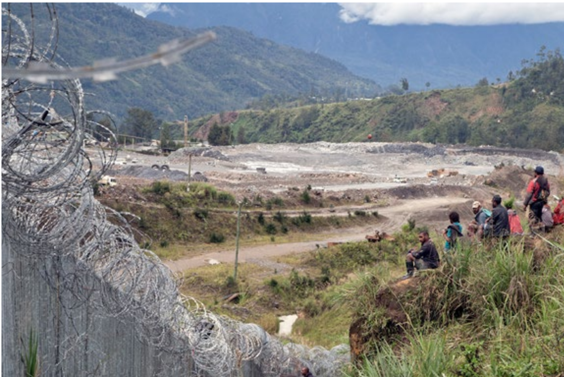
Top: View of the mine site from a village in Porgera.