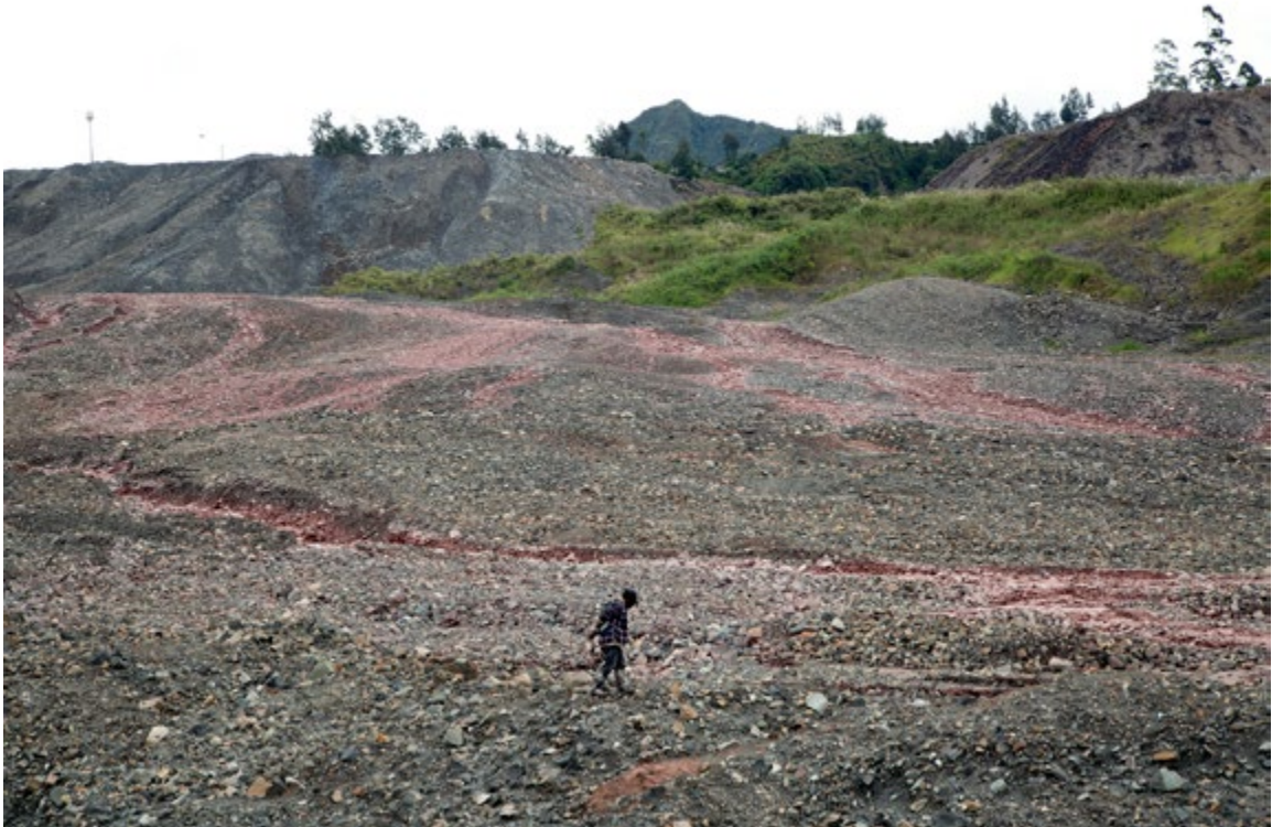
Top: Panning for gold in Porgera.