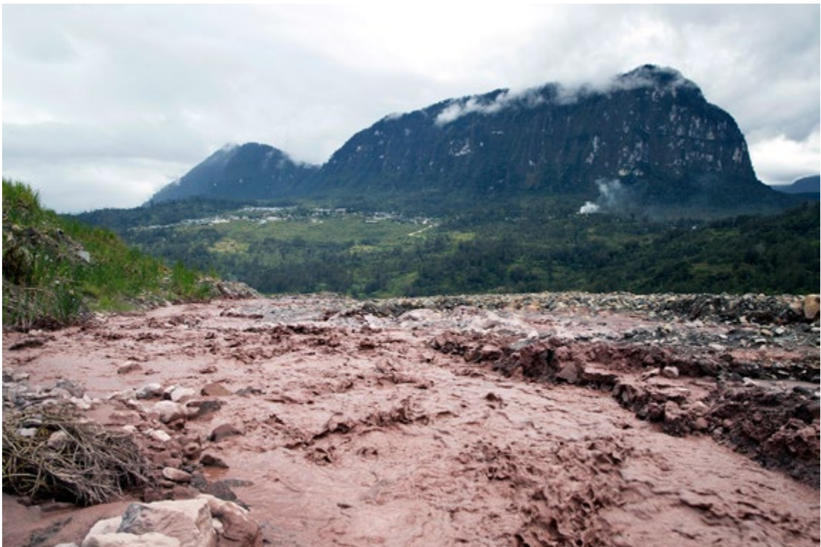
Top: A woman in Porgera.