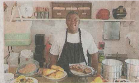
Ruschmeyer's, a refurbished camplike resort, is the hot spot with the fashion crowd this summer.