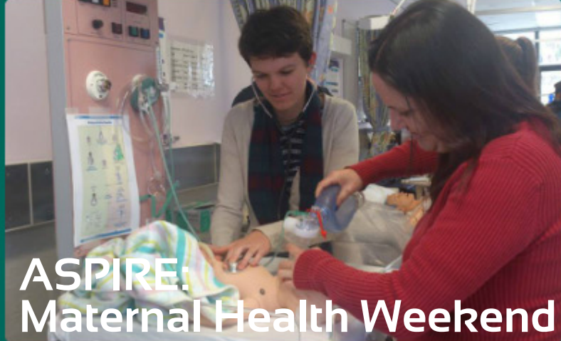
ASPIRE: Maternal Health Weekend