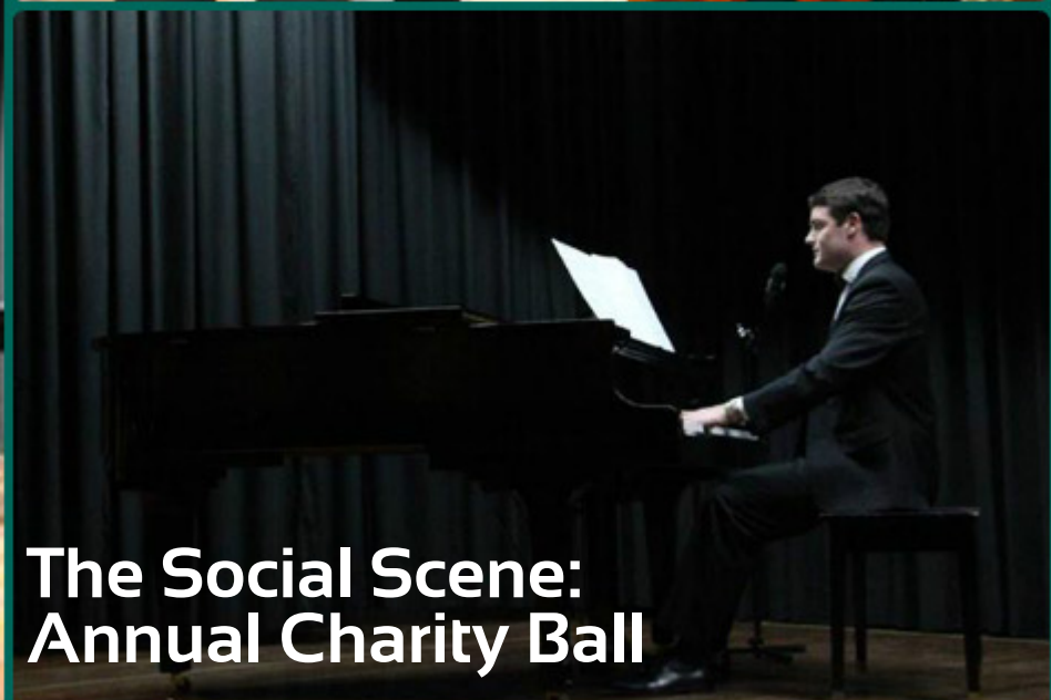
The Social Scene: Annual Charity Ball