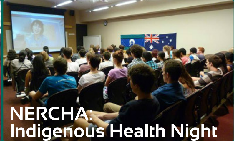
NERCHA: Indigenous Health Night