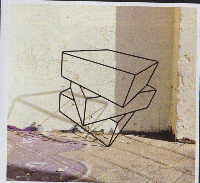
▲ 3D ILLUSION BY SHAI LEVI Tel Aviv, Israel Since 2012 // I wanted to translate my 2D sketches into 3D objects that are simplistic but create lots of spatial dimension and depth. //