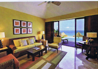
Left top: Guestroom at the Fairmont Mayakoba in the Riviera Maya. Left below: Poolside at The Fairmont Pierre Marques in Acapulco.