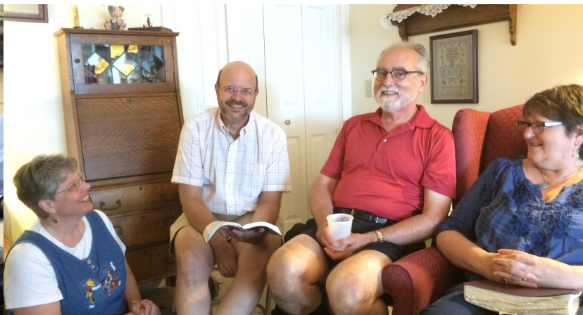
Teaching Peace to PCC board in Rockford, Michigan