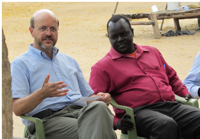
Teaching peace to MCH staff in Werkok, South Sudan

“For God was pleased to have all His fullness dwell in Him, and through Him to reconcile to Himself all things, whether things on earth or things in heaven, by making peace through His blood, shed on the cross.”