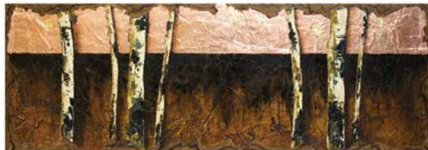
We Are Brilliant Together: Five Piece Suite