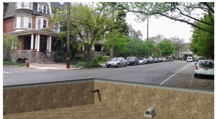
Rendering of completed PWD facilities beneath 48th St & Beaumont St.