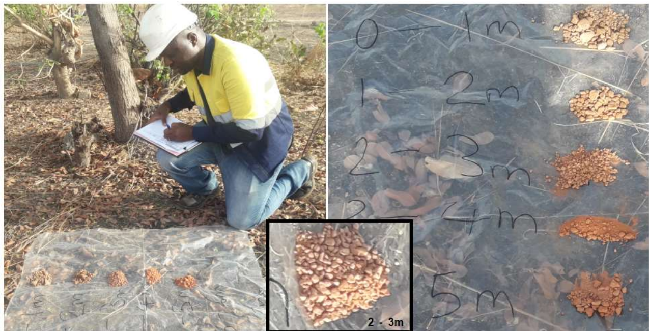
Figure 4: Company Geologist logging Conglomerate Bauxite at Bouba South

Figure 4 below shows one of the Company's Geologists logging the Conglomerate Bauxite from Bouba South during the drilling program.