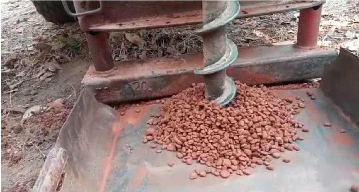
Figure 2: Drilling Conglomerate Bauxite Bouba Plateaux