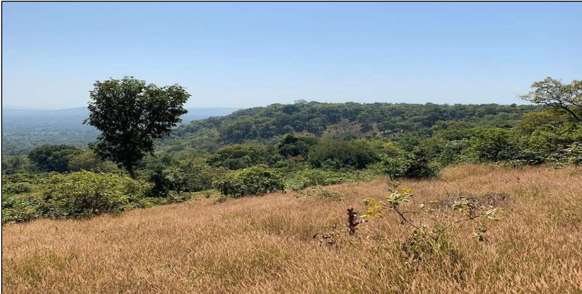
Figure 1: Conglomerate Bauxite Plateaux (Bouba) Looking north

Figure 1 below is the conglomerate Bauxite Plateaux (Bouba) looking north