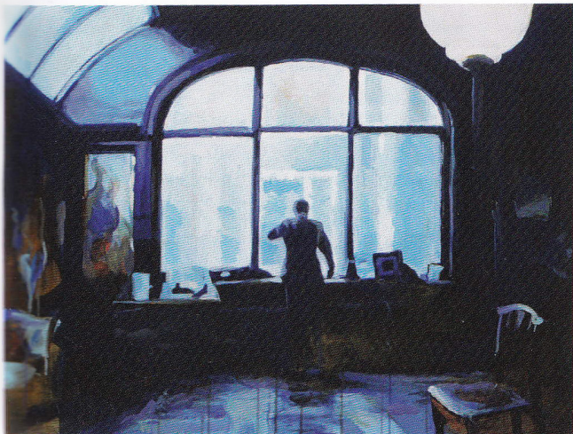
No. 27 (Awaken) , 2013, acrylic on panel, 8" x 10"