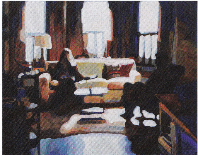
No. 20 (Unspoken) , 2013, acrylic on canvas, 22" x 28"