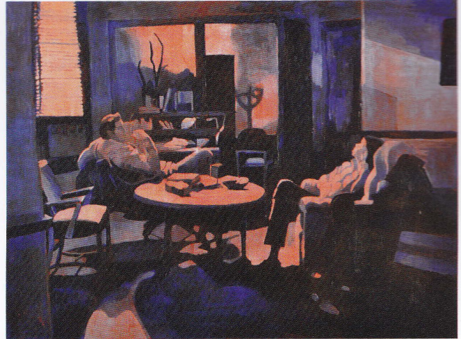
Therapy No. 17 (Cross Currents) , acrylic on canvas, 30" x 40"

My work explores themes of revealing versus concealing—through light that illuminates and reveals the space and shadows that obscure and conceal. Disconnection versus connection—in compositions where figures relate to each other in an ambiguous way, wanting connection, but not necessarily achieving it. And present versus past—where composition and graphic style convey the physical reality of the present, but the darkness and blurred, silhouetted figures suggest mysterious interiors where past mingles with present.