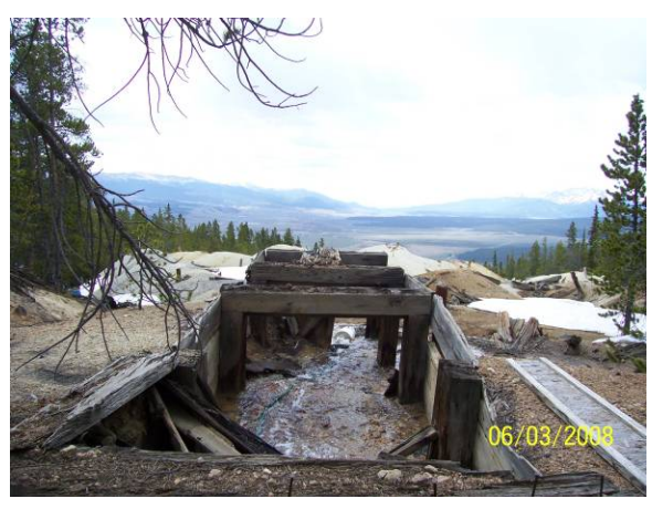
Acid mine drainage from the collapsed Tiger Tunnel runs across the large mine waste pile.

In addition, the analysis recommended that hydrologic controls constructed above and along both sides of the would further reduce surface repository water contamination. The waste pile reclamation and hydrologic controls phase of the project will be completed in Spring 2010. To address the acid mine drainage discharging from the Tiger Tunnel itself, Trout Unlimited, Colorado Mountain College, and the Colorado School of Mines is currently in the process of developing a sulfate-reducing bioreactor design that will further reduce the metals loading entering the surface streams.