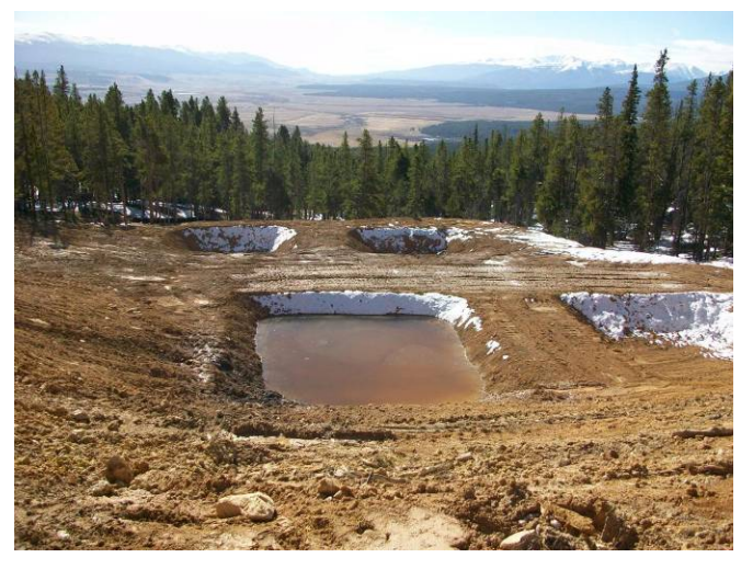
At the completion of the removal of the mine waste pile and the construction of the repository, future SRB cells were excavated. These cells will likely remain empty and inactive until the passage of federal Good Samaritan legislation.