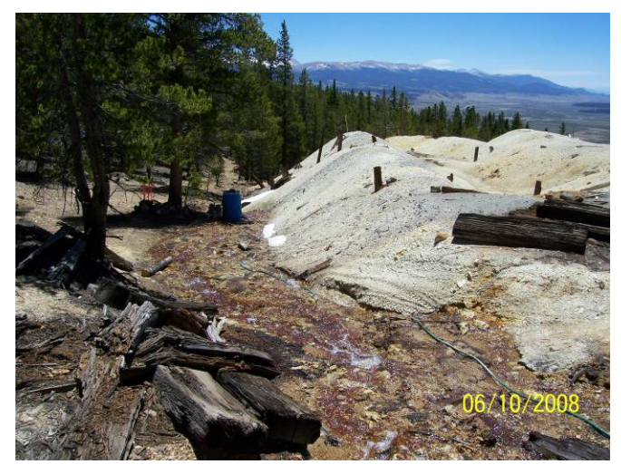
The Tiger Tunnel drainage and the large mine waste pile that was removed by the BLM in 2009. This drainage has a very low pH and is high in heavy metals, and plays a large role in the Lake Fork of the Arkansas being one of Colorado's most polluted rivers.

The Tiger Mine is not alone. Across the West there are hundreds of similar historic mine tunnels polluting rivers with toxic acid mine drainage that cannot be touched because of the Clean Water Act – the monumental legislation that was intended to make all the waterways of the United States fishable and swimmable. Ironically, it's the major law preventing successful cleanups in watersheds impacted by legacy mining and acid mine drainage. In many places, would-be Good Samaritans walk away from cleanup projects just like the Tiger Mine for fear that they may be sued. For years Congress has been considering various versions Good Samaritan legislation and it's time that it finally passes. Our rivers need it. Fish need it.