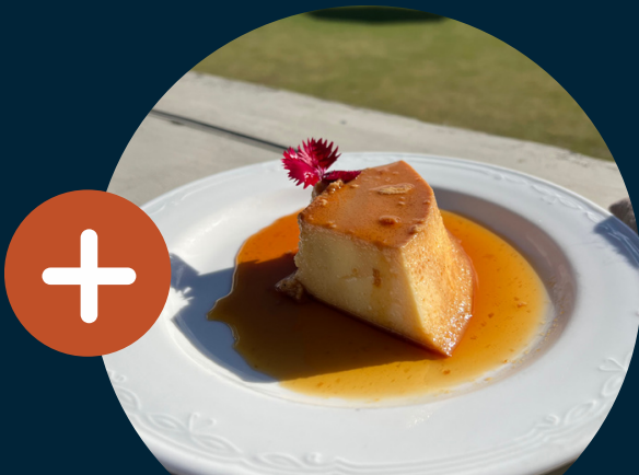
Condensed Milk Pudding