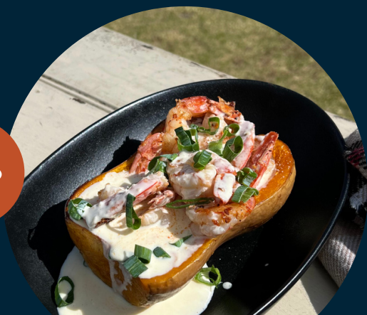
Flambé Garlic Prawns in Butternut Pumpkin