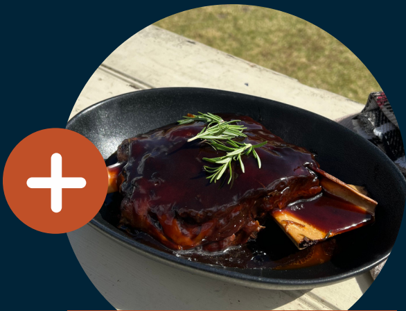
Lamb Shoulder with Bam Bam Jus