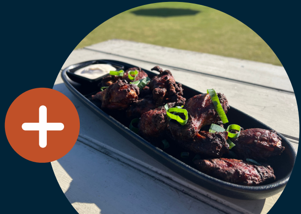
Chicken Wings with Rare Blend Mayo