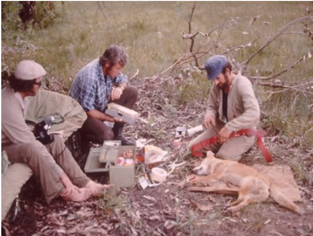
Measuring fox cubs at a den site 1984

Would you like to learn more about our place from real experts? Join us to hear 12 leading scientists talk about what they discovered in their pioneering research in our region and how things are changing. Learn about the work that led to Nadgee being declared a Nature Reserve and see the results of over 50 years of Shearwater studies at Montagu Island.