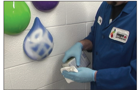
Technician tests mineral spirits on non-conspicuous area.