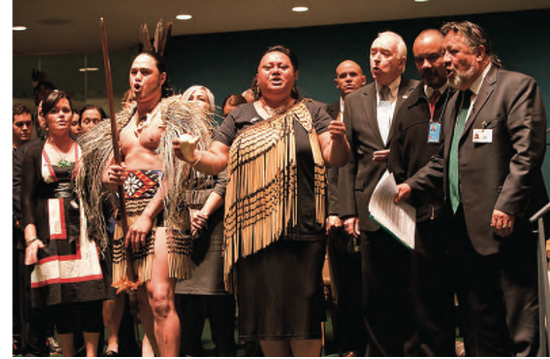
The UN Declaration of Rights of Indigenous Peoples upholds the right to consent.

The advantage to acting now and caring for present generations is that it will set us on a course that increases the chance that Future Generations will have a habitable and healthy world. When setting out on a long journey, a tiny shift in the compass direction we choose can make all the difference in where we end up. I think of that compass direction in light of a dream a beloved had a few years ago. He is also an indigenous man and had gone to support an Indian tribe in a mining struggle on the border of Canada and