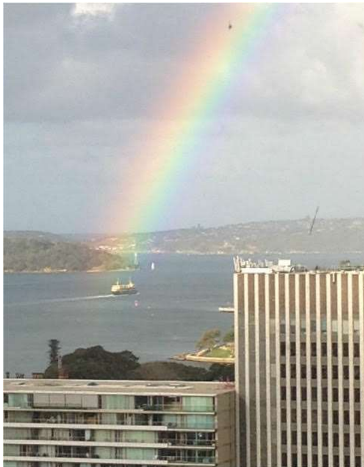
Ferry at the end of a rainbow on Sydney Harbour, August 2014

To learn more about the Life Sciences sector on the ASX and our firm, please visit ndfresearch.com .