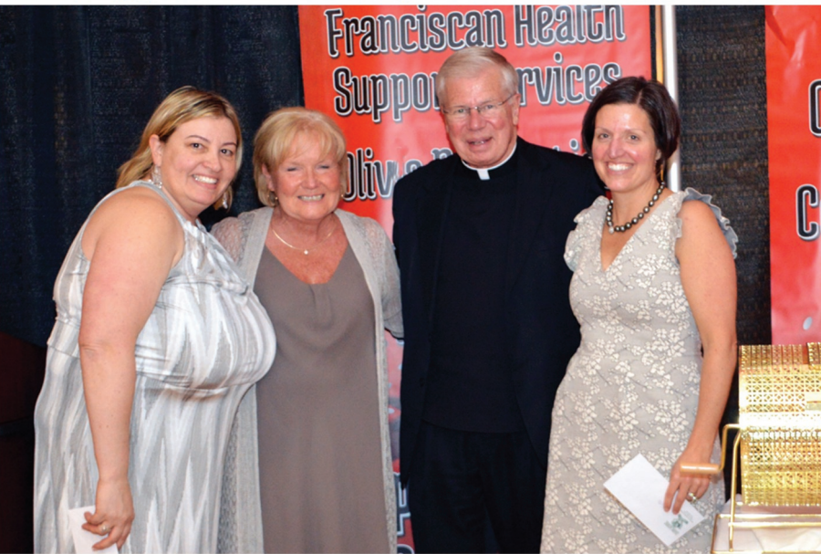
Thank you to all who made our Holy Cross Auction such an amazing night! We are so thankful for the many people who worked diligently to make the evening such a success. Thank you as well to everyone who attended and supported Holy Cross School. We couldn't do it without you!