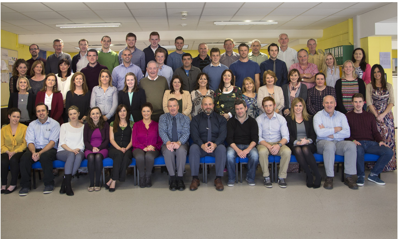
The teachers, student teachers, SNAs, office staff, caretakers, supervisors and cleaning team