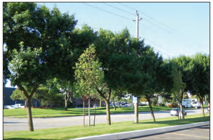
Fig. 2. Healthy-looking ash trees with no visible sign or symptom, but determined to be infested with EAB using branch sampling.

Ryall et al. (2010) sampled many ash trees with no obvious sign or symptom of EAB attack (Fig. 2) and showed that branch sampling was an effective method of detecting EAB-infested trees; indeed, 74% of the infested trees would have been discovered if the method described below had been used. The purpose of this note is to describe this basic sampling technique.