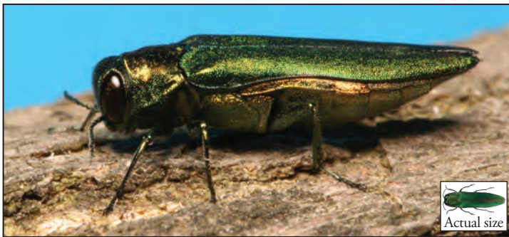
Fig. 1. Adult emerald ash borer.

The emerald ash borer (EAB), Agrilus planipennis Fairmaire (Fig. 1), a non-native insect pest of Asian origin, presently infests large numbers of ash ( Fraxinus spp.) trees in Ontario and Québec and could soon spread to other provinces.