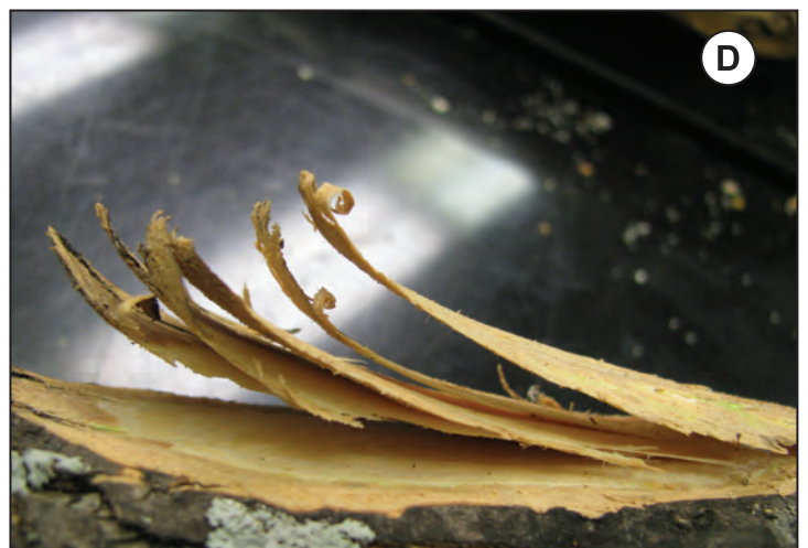
Fig. 3. Cutting (a), measuring and trimming (b) ash branches. Branches, cut to a length of 29.5 inches (75 cm), are placed in a vise and bark is whittled off the basal 19.7 inches (50 cm) (c) (1.5 m piece shown here). Whittling removes bark in thin .04-.08 inch (1-2 mm)