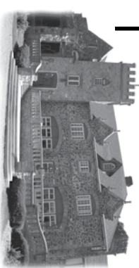
Highlands Ranch Mansion 9900 S. Ranch Road Highlands Ranch, CO 80130