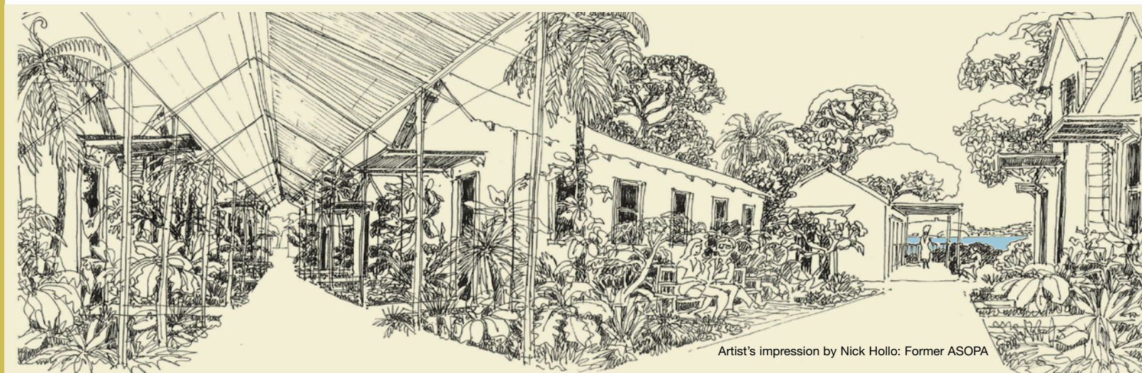
Artist's impression by Nick Hollo: Former ASOPA

Combining heritage features such as polished floorboards, vaulted ceilings and verandahs, the simple structure of the buildings belies their elegant contemporary fit-out which includes reverse cycle air conditioning, full disabled access and environmental features such as rainwater recycling and energy efficient fittings. A new car park will be provided as part of the Harbour Trust's upgrade works.