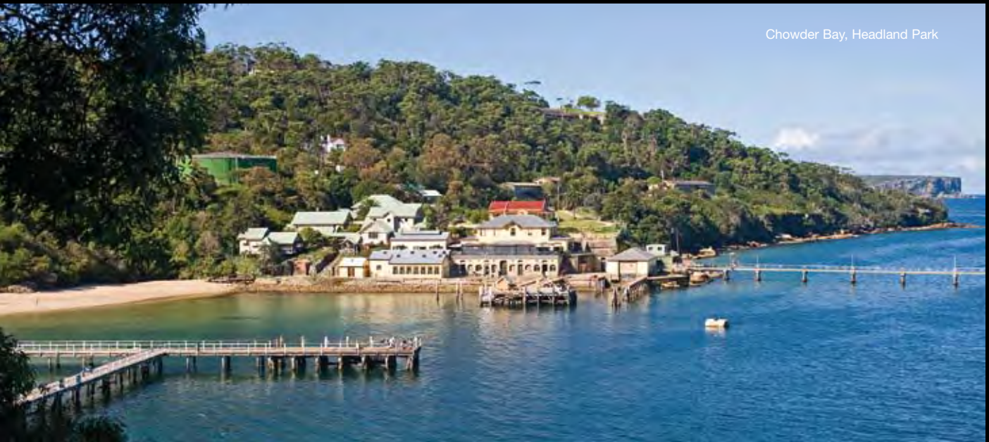
Chowder Bay, Headland Park