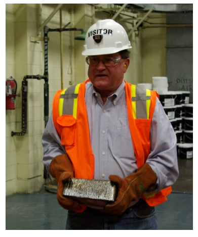
Senator Curtis King holds an 80-pound gold bar.

After the meeting committee members travelled to