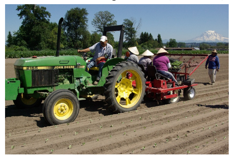
Puyallup Valley farming operation

The Legislative Committee on Economic Development and International Relations (LCEDIR) met twice in 2014, first covering the historic (and still vital) farming and floriculture industry in western