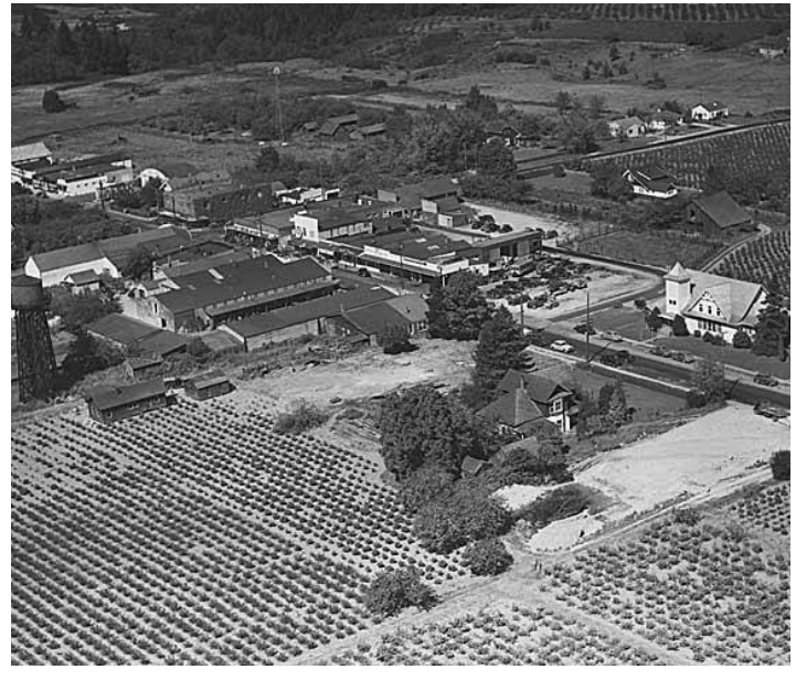
Vashon Island farm in 1946 (Courtesy of MOHAI, Seattle P-I Collection, PI27880