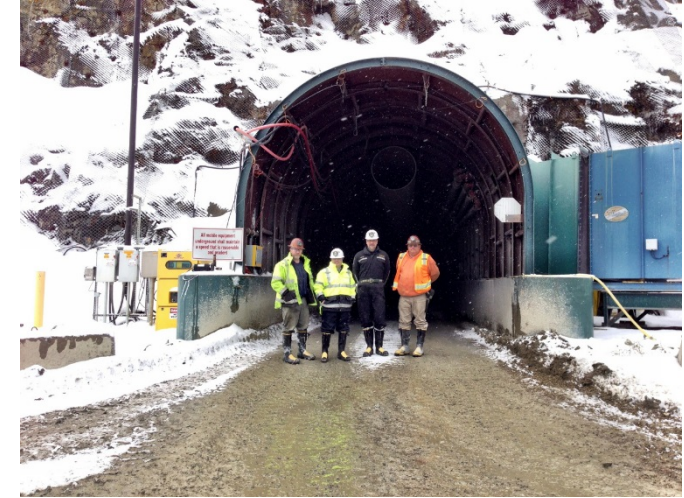
Lt. Governor Owen, seen second from left, visited the Buckhorn Gold Mine in April

Chesaw in Okanogan County, operated since 2008 by the Kinross Corporation. The mine is reaching the end of its life cycle and is expected to close when its reserves are depleted sometime in late 2015. A separate Kinross operation, the Kettle River Mill, processes ore from the mine. LCEDIR members toured the mill, which is near Republic, following the morning work session.