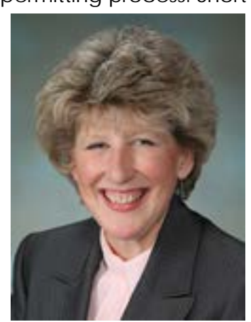
Rep. Shelly Short

complained that the new forest supervisor has been on duty a year-and-a-half without a visit to Republic. Even with an abundance of bi-partisan cooperation from the Governor's office, the two U.S. Senators, the district's congresswoman and local delegation, the forest service has declined to help. There are problems with both state and federal regulations, she said. Sometimes it's not the regulation itself, but the level of authority that agencies have independent of their supervisors. Positions are developed that stall and stop progress. Part of the challenge of legislators is to create better balance in what level of authority agencies have to make sure we are not relinquishing their role of oversight. Sometimes key people in key positions prevent things from moving forward. Rep. Short said she is stunned by the endless amounts of data that is requested from agencies. While regulations are needed to protect the environment, it's sometimes how those regulations are implemented that creates problems, she said. She thanked the committee for coming to Republic.