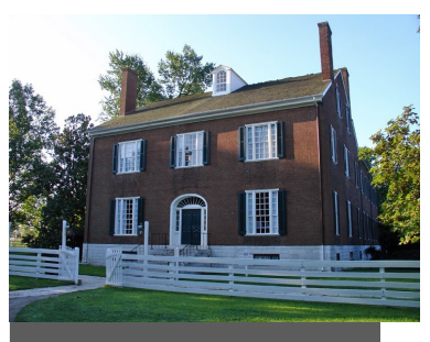
Shaker Village at Pleasant Hill, Kentucky