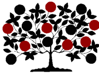
SHAKER VILLAGE OF PLEASANT HILL