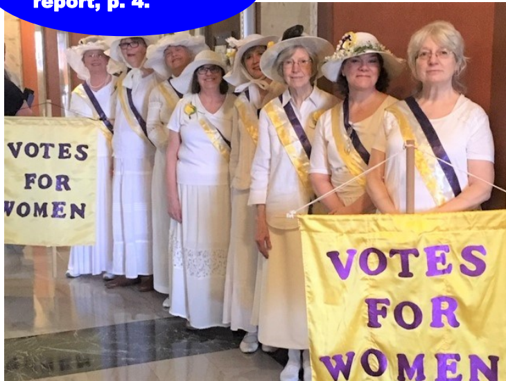
The Suffragist Choir took part in the festivities in Frankfort for League Day at the Capitol on Feb. 7.

See felony disenfranchisement report, p. 4.