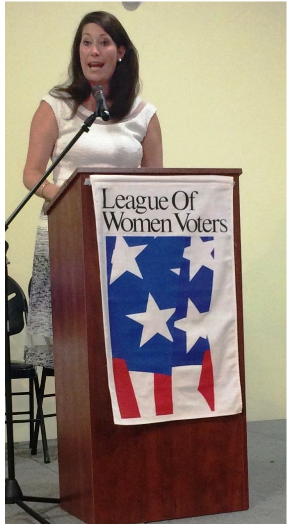
Kentucky Secretary of State Allison Lundergan Grimes was among the many speakers at the 2017 Women's Equality Day event, co-sponsored by the League of Women Voters of Louisville and the Frazier History Museum.