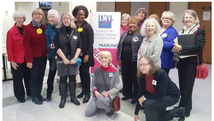
League of Women Voters members from Hopkinsville, Louisville, Bell County, Richmond Danville and Lexington descended on Frankfort for League Day at the Capitol on Feb. 14.