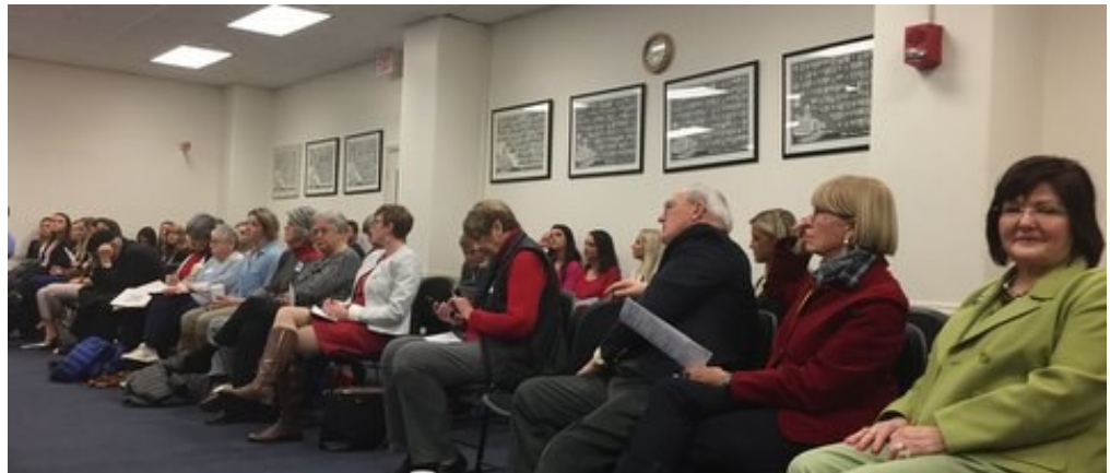
League of Women Voters members from across the state gathered to hear about the League's new redistricting report.