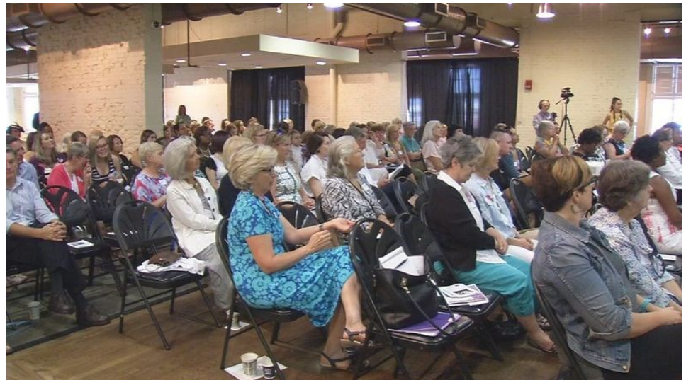
The audience listens attentively at the 2017 Women's Equality Day program at the Frazier History Museum in Louisville. The museum will also host the 2018 program in August.

http://www.ncwhs.org/index.php/projects/trails/293-votes-for-women-trail