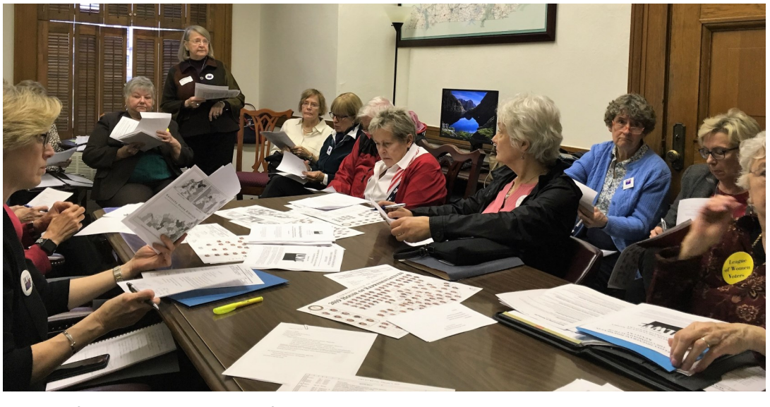
League of Women Voters members from Louisville, Lexington, Bell County, and Northern Kentucky descended on Frankfort for League Day at the Capitol on Feb. 7.