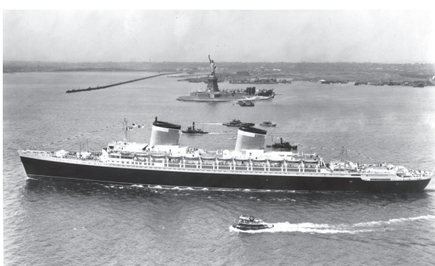
Above: Photo courtesy of Robert G. Lenzer