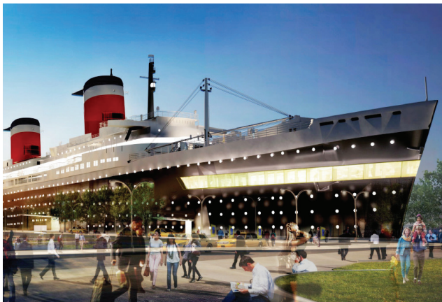
Below: Example of Conceptual Redevelopment Rendering of Ship Proposed by Designers

The SS United States is an unrivaled design and engineering achievement. Like the Statue of Liberty and the Washington Monument, the SS United States is an icon for all ages. As one of the last remaining superliners from the golden age of transatlantic travel, the SS United States is an enduring testament to the stories of the individuals who built her, worked aboard her, and sailed on her. The history of the SS United States highlights important aspects of the history of the nation, such as immigration, industrialization, racial integration, technological innovation, class dynamics, and American patriotism.