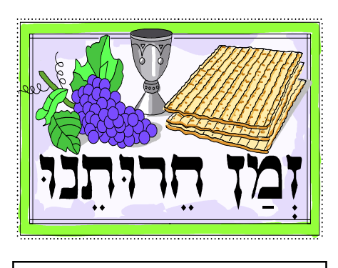
"The time of our Redemption" HAPPY PASSOVER!!

Recently, a young woman called our office and left a message for what she believed to be a synagogue. She said she was Jewish and had a friend who had just had a baby who was in dire financial straits. She wondered if the ladies of the synagogue could help with diapers and baby clothes. Or, could we recommend some place she could go for help.