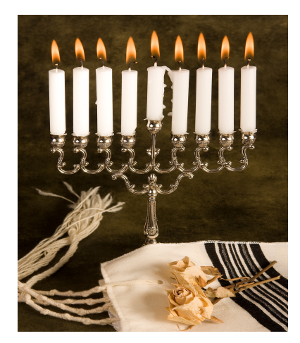
worship of Zeus.

In 168 B.C. the holy Temple in Jerusalem was seized and dedicated to the