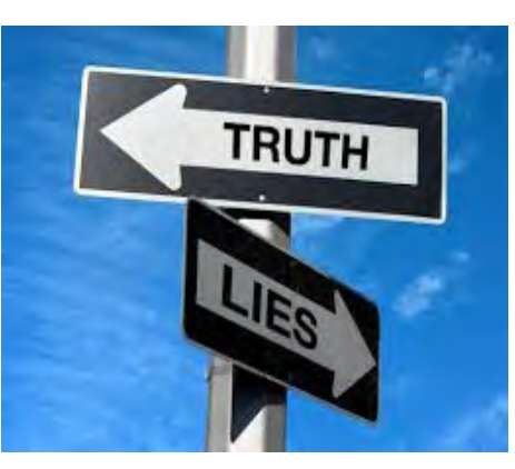
chosen people? God would not keep THEM out of heaven if they don't accept Jesus...would He?

There was an interesting article in the Atlanta Journal Constitution a few years back. In bold letters the headline proclaimed, "Christian Group says Jews Don't Need Jesus." No new idea here. Throughout the centuries men have debated whether people need to believe in Jesus in order to have a relationship with God. This issue, for many who call themselves Christians, becomes more of a dilemma when discussing the Jewish people. It is easier to say that those of other faiths or religions, who are not Jewish, need to be reached with Jesus. But, God's