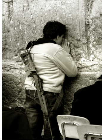
The Creation Of The Conflict

W e have begun the year with war escalating in the Middle East. Hamas mortar shells from Gaza have been showering down on Israel for years. Now Israel has retaliated, invading Gaza from both the air and by land. The world's attention has turned to Israel. Nations of the world have gathered together to discuss how peace can be attained. The United Nations Security Council has convened and asked Israel to cease their aggression against the Palestinians as rockets from Gaza continue to rain down on southern Israel. Israel is under attack. Gaza is under siege. The world watches.