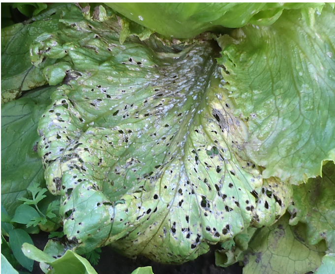
Anthracnose symptoms on lettuce

Lettuce anthracnose is an intermittent disease in Australia, driven mainly by extended periods of wet weather, particularly mild-cool wet periods. When these conditions occur, crop losses can be severe. The disease mainly affects field-grown crops, and while it can occur under protected cropping it is usually less frequent and less severe.