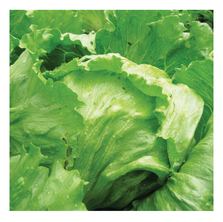
Head lettuce at the correct stage for harvesting.