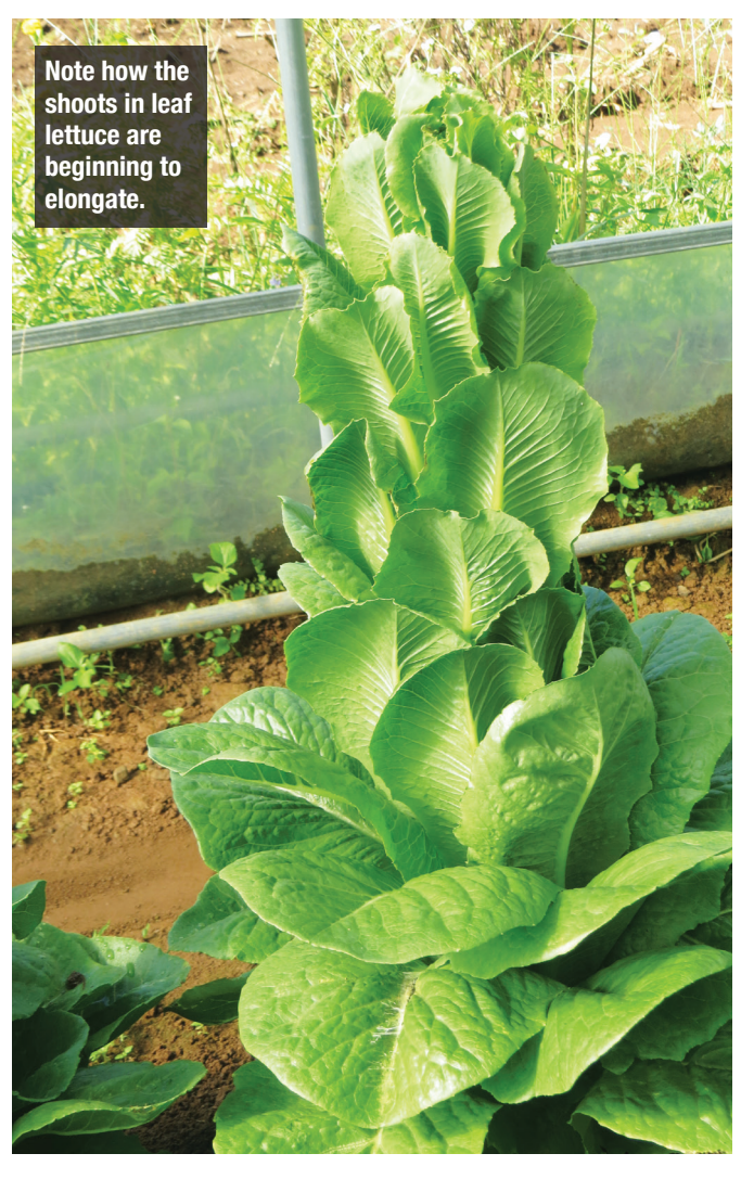
Bolting in lettuce is an undesirable development and should be prevented.

The finished crop should immediately be removed and destroyed, and the ground ploughed to prevent pest and disease populations spreading to other crops. This is extremely important!