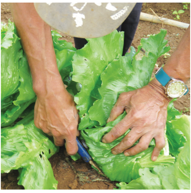
To harvest lettuce, cut away from the stalk with a sharp knife.