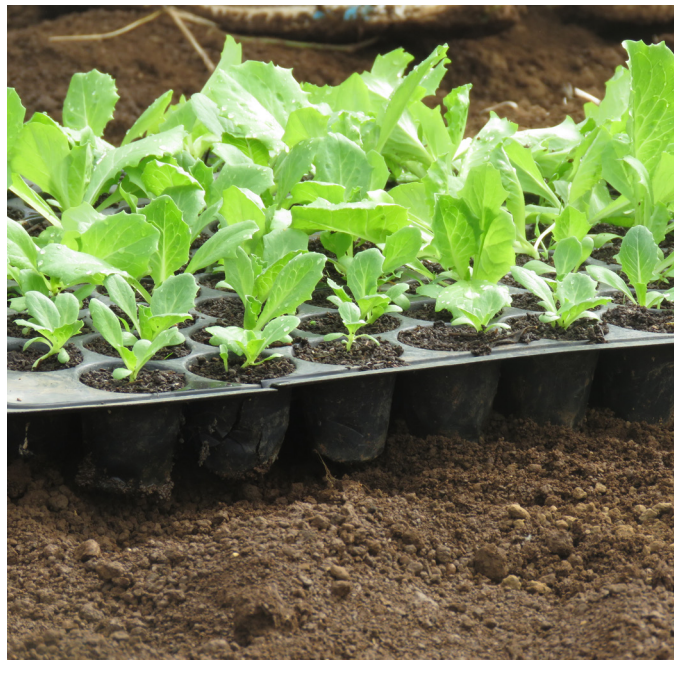
Lettuce seedlings ready to plant.

Morning is the best time for the harvest as the heads are cool and are firmest.