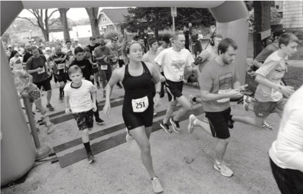
Runners head north on 69th Street after the start of the 2018 Run Tosa Run. The 2019 race is scheduled for May 18.