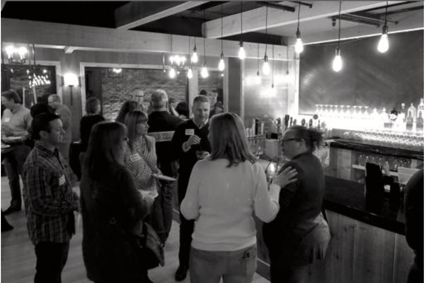
About 80 members joined us for Taste of East Tosa on Nov. 8 at Birch, the event space next to Camp Bar.