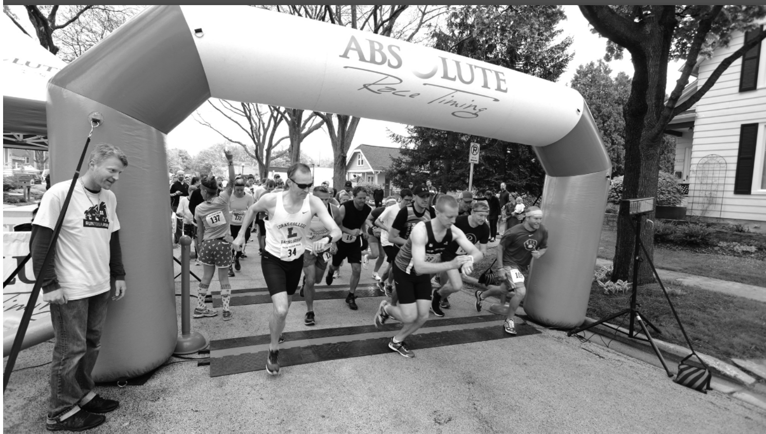
Runners take off from the start of the Run Tosa Run 5K race on May 19.