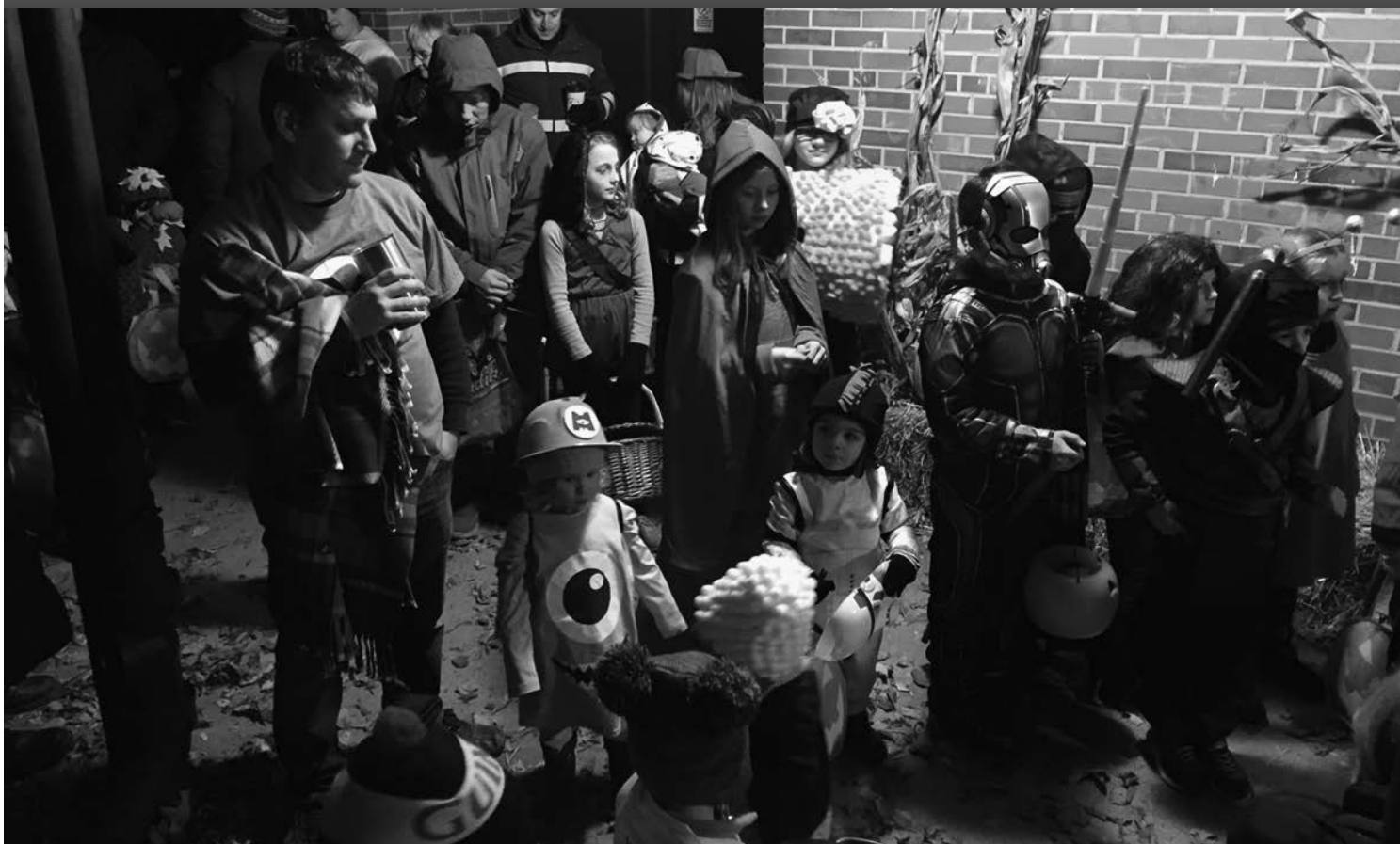
Families gather at Center Street Park for the kickoff event for TETNA's nighttime Trick or Treat.