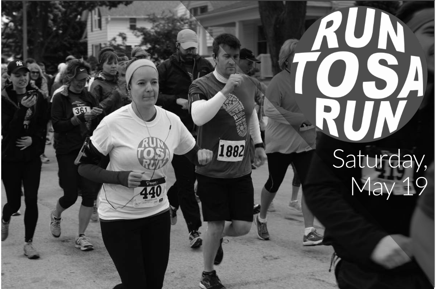
Participants in the Run Tosa Run 5K take off from the 2017 race's starting line.