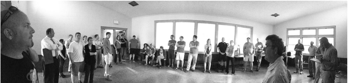
Residents and officials meet in the Center Street Park Pavilion to discuss the park's future.

Learn more about plans for re-imagining Center Street Park at https://www.facebook.com/groups/centerstreetpark/