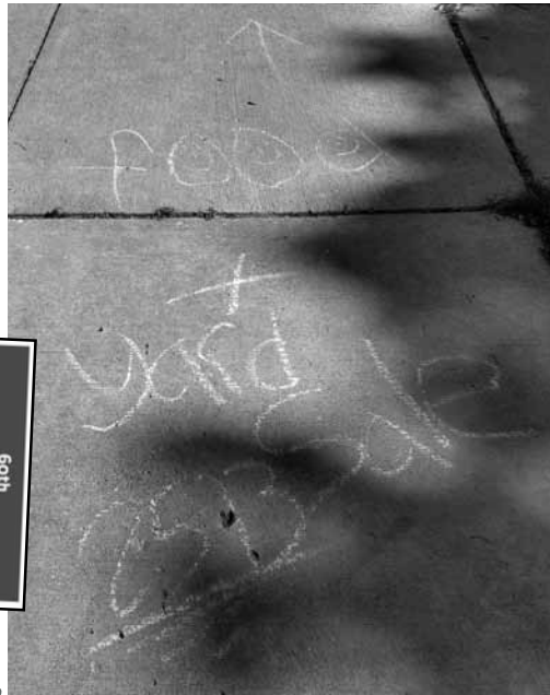
Left Behind: All that remains after a successful rummage day in the neighborhood is the writing on the sidewalk.