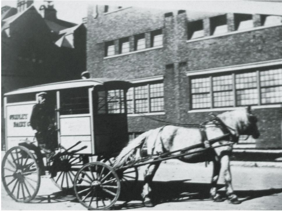
Above: Gridley Dairy Company horse-drawn delivery wagon. Below: Today, St. Pius partners with the YMCA of Metropolitan Milwaukee to provide a West Suburban YMCA Program Center in the gym.